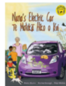
NANA'S ELECTRIC CAR - TE MOTOKĀ HIKO O KUI