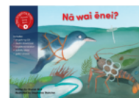
NĀ WAI ĒNEI? (SINGALONG BOOK & CD)