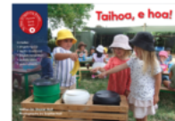
TAIHOA, E HOA (SINGALONG BOOK & CD)