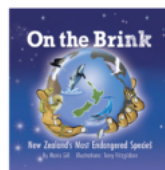
ON THE BRINK NEW ZEALAND'S MOST ENDANGERED SPECIES