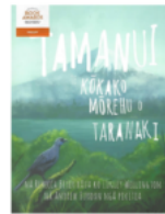
TAMANUI TE KŌKAKO MŌREHU O TARANAKI