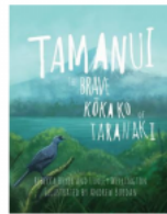
TAMANUI THE BRAVE KOKAKO OF TARANAKI