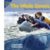
THE WHALE SAVERS RETURNING WĒRA TO THE OCEAN