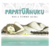
PAPATŪĀNUKU HAS A TUMMY ACHE