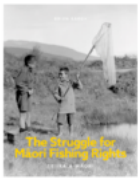
THE STRUGGLE FOR MĀORI FISHING RIGHTS: TE IKA A MĀORI